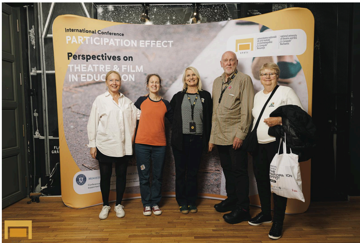
IDEA members together

Overall, the conference contributed to ongoing international dialogue and collaboration in theatre and film education, reinforcing the importance of artistic practices as tools for learning, research and social engagement.